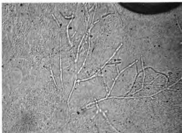
Figure 1. Microphotograph depicting the presence of abundant Candida sp. pseudomycelia in direct examination of centrifuged fresh urine.

Sepsis by Candida was defined as the growth of Candida in a blood culture and/or by the presence of serum mannan antigen for Candida for monoclonal antibodies in febrile or hypothermic patients; in those hemodynamically unstable, and with laboratory data consistent with sepsis.