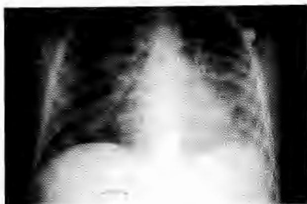
Figure 5. This chest X ray shows marked micro and macronodular infiltrate; alveolar condensation and a bronchogram.

antigens (15 ng/mL). However, a positive test is considered diagnostic when a patient has respiratory symptoms, and a positive sputum culture for septated dichotomized mycelium. It must be pointed out that other techniques are capable of detecting serum antigen levels as low as 1 ng/mL but this increase in sensitivity results in a larger number of false positive tests. 16,17