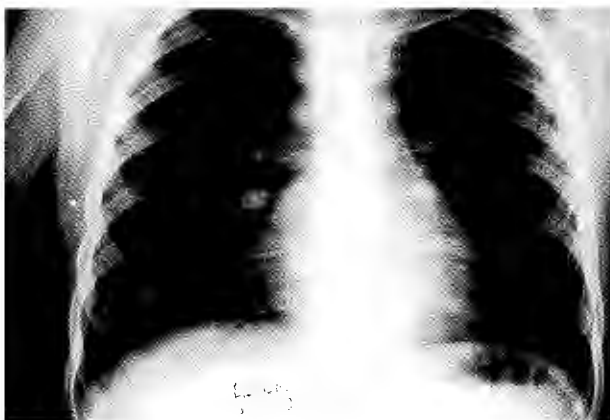
Figure 4. A chest X ray showing a generalized interstitial infiltrate and a bronchogram.

The diagnosis of pulmonary aspergillosis is very difficult because of its polymorphic clinical features and because most hospital laboratories are not equipped with the necessary tools for the early diagnosis of the infection. Most facilities can only do direct examinations and culture of sputum or of bronchial aspirate. In addition, the presence of one or more positive cultures for the same species of Aspergillus does not necessarily indicate that an infection exists; furthermore cultures may be positive in cases of saprophytic colonization of upper airways and in patients with allergic broncho-