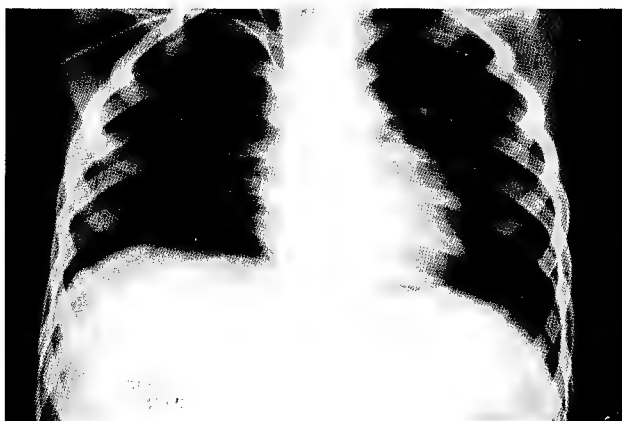
Figure 1. Chest X rays of a patient with aspergillosis. There is a parahilar interstitial infiltrate in the right apical area and a left parahilar nodular lesion.